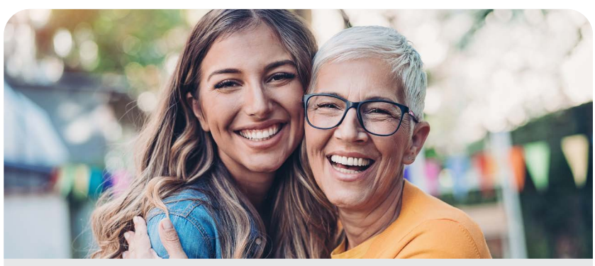
Learn how DentistLink can help your practice.

DentistLink is managed by Arcora Foundation in partnership with the Washington State Health Care Authority.